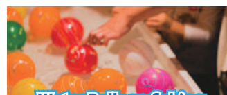
Water Balloon fishing

Let's challenge the water balloon fishing!